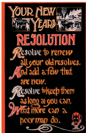
Early 20th century New Year's resolutions post card.

Would you like to have a daily Bible reading chart? Contact "Christ for Today" at the addresses on the back page!